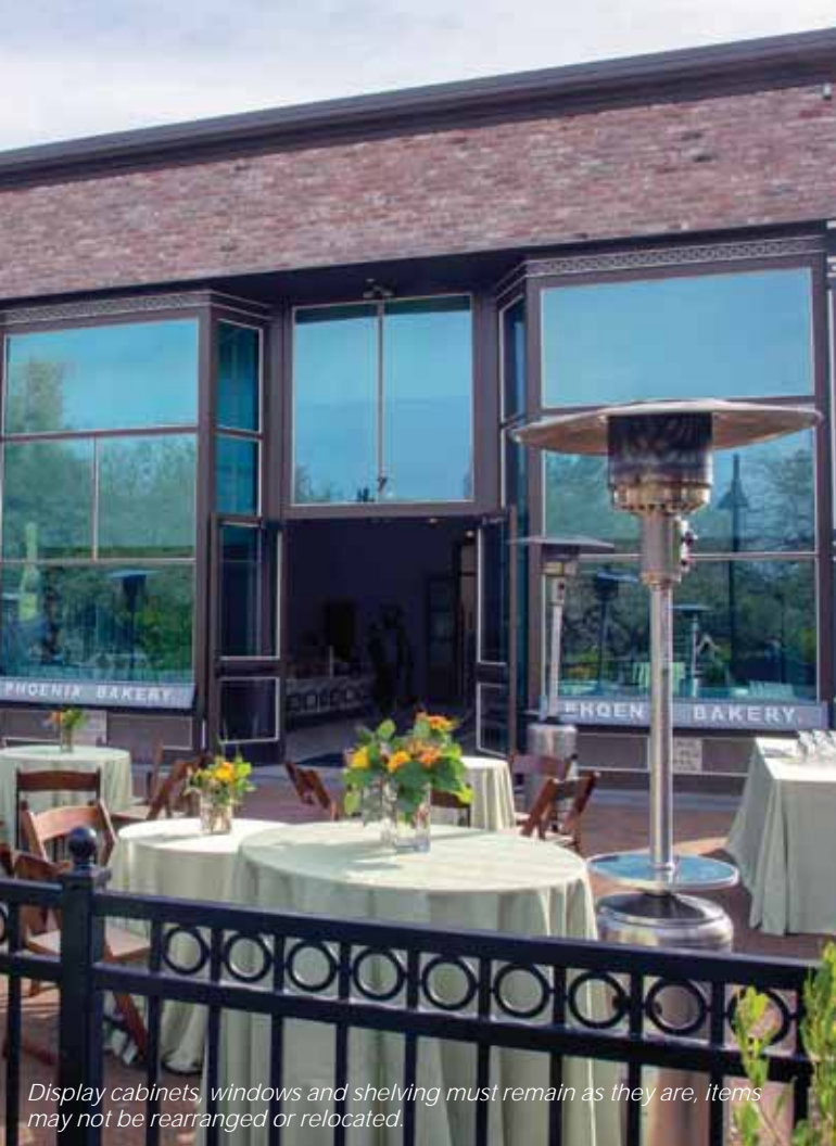
Display cabinets, windows and shelving must remain as they are, items may not be rearranged or relocated.