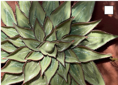
Jim Sudal Amazing Agave Ceramic agave