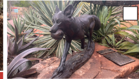
Veryl Goodnight Fall Harvest Bronze fox with apple