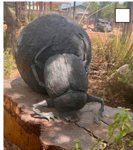
Paul Rhymer One Man's Trash Bronze dung beetle