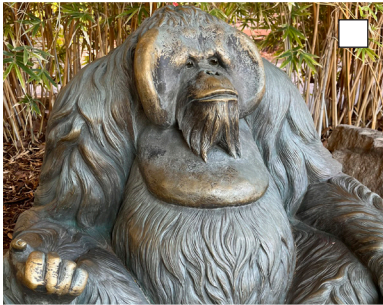
Tom Tischler The Old Man of the Forest Bronze orangutan