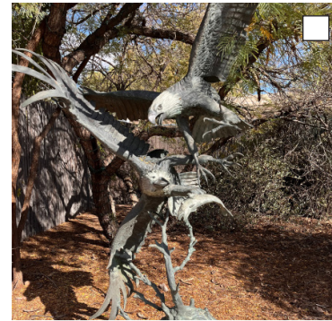
Max Turner Fighting Eagles Bronze eagle