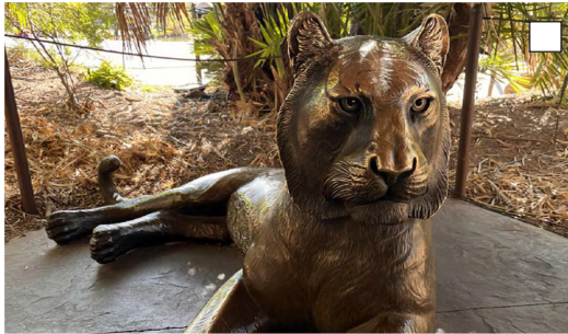
Tom Tischler Tiger Bronze tiger