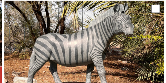
Gedion Nyanhongo Auxiliary Zebra Stone zebra