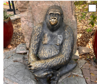
Vincent Maggiore Hazel Bronze gorilla